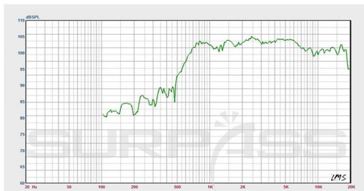
Sound Pressure Level/Mixer Frequency Sweeping Regulation